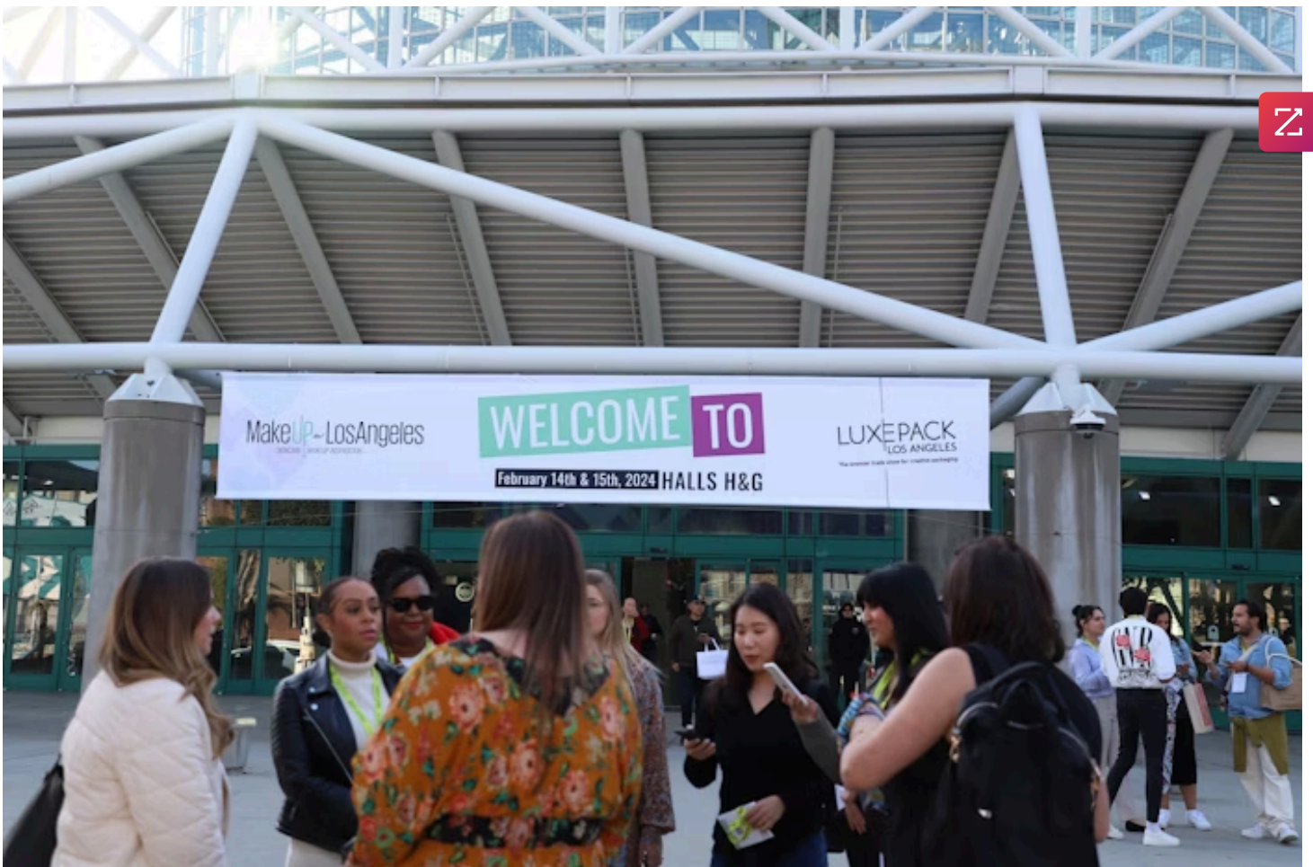
MakeUp in/Luxe Pack Los Angeles boasted 5,250 visitors at its 2024 edition, held February 14-15.