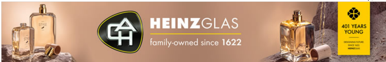
( https://www.premiumbeautynews.com/cgi-bin/advert-pro.cgi?type=clic&id=424&zone=17 )

Subject=Schwan%20Cosmetics%20combines%20makeup%20and%20skincare%20with%20new%20Glowy%20Blur%20Stick%20-%20Premium%20Beauty%20News&Body=https://www.premiumbeautynews.com/en/schwan-cosmetics-combines-makeup,23413)