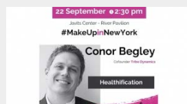
Tribe Dynamics To Present 'Healthification'