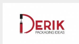
Derik Offers Refillable Compacts in a Range of Sizes