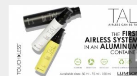
Lumson Introduces First Airless System in an Aluminum Container