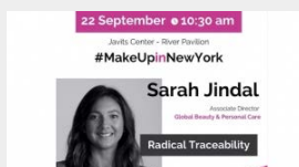
Mintel To Talk About Traceability