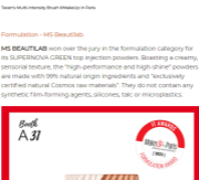
MS BEAUTILAB'S SUPERNOVA GREEN @MakeUp in Paris

MS BEAUTILAB won over the jury in the formulation category for its SUPERNOVA GREEN top injection powders. Boasting a creamy, sensorial texture, the "high-performance and high-shine" powders are made with 99% natural origin ingredients and "exclusively certified natural Cosmos raw materials". They do not contain any synthetic film-forming agents, silicones, talc or microplastics.