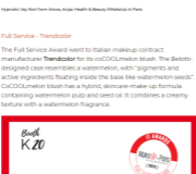
Trendcolor's coCOOLmelon blush @MakeUp in Paris

The Full Service Award went to Italian makeup contract manufacturer Trendcolor for its coCOOLmelon blush. The Belotti-designed case resembles a watermelon, with "pigments and active ingredients floating inside the base like watermelon seeds". CoCOOLmelon blush has a hybrid, skincare-make-up formula containing watermelon pulp and seed oil. It combines a creamy texture with a watermelon fragrance.