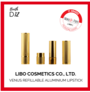
Libo Cosmetics' Venus Refillable Aluminum Lipstick @MakeUp in Paris