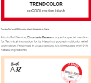
Chromavis Fareva's Maya relief technology @MakeUp in Paris

Also in Full Service, Chromavis Fareva scooped a special mention for Technical Innovation for its Maya hot-poured multicolor relief technology. Presented in a cast texture, it is formulated with 94% natural ingredients.